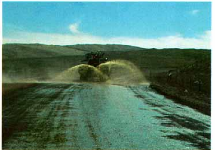
Coherex being sprayed on haul road at Bridger Coal, Wyoming.

Bridger Coal does away with haul road dust at Wyo. coal mine. At Bridger Coal Company near Rock Springs, Wyoming, dust on haul and access roads became a serious problem after the mine began operations in mid-1974. As traffic from 120-ton coal haulers and ash trucks built up, dust became increasingly acute and made driving hazardous. The company's Coherex dust retardant program, which went into full operation early the next year, provided a safer, cleaner environment for the truck drivers and negated the need for additional watering trucks to keep the dust down. An additional benefit of Coherex is its ability to stabilize the soil without harming vegetation or deterring plant growth. This will be especially important when Bridger Coal returns its roadways to nature.