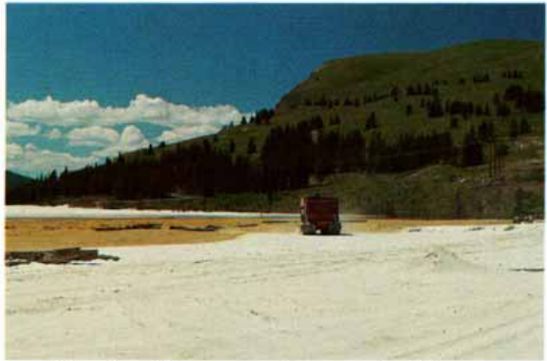
Spraying Coherex on tailing pond at Climax Molybdenum, Colorado.

Company evaluated a number of chemical agents in a search for an effective and economical way of controlling dust coming off the tailing ponds and dam faces at its mining sites in Climax, Colorado. Sloping terrain and high-altitude climatic conditions combined with cost and toxicity considerations eliminate most of the contenders. Treatments with Coherex dust retardant, mixed with wastewater from